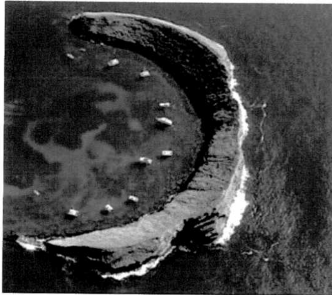
Molokini Marine Life Conservation District, Maui